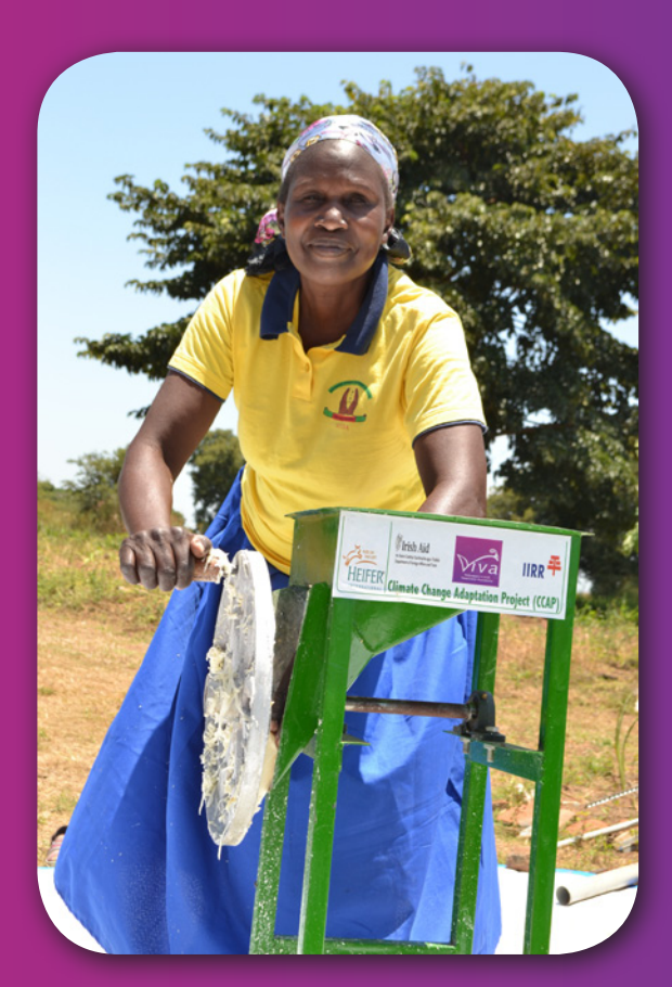
a farmer demonstrates a groundnut shelling machine. This removes the husk from the groundnuts to give you what we know as peanuts.